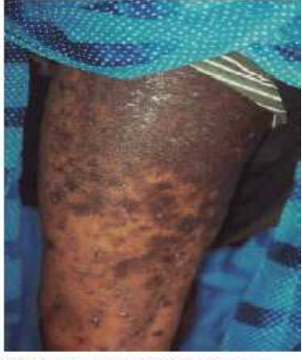
Figure 3 Pigmennary disorder: hypo-hyperpigmennatic

and/or hydroquinone in skin-lightening creams, among other factors. Ammoniated mercury, used in some skin-lightening creams, can cause rashes and allergic reactions (photo to the left). Other ingredients in these products, in