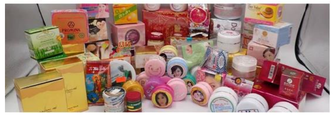
Examples of skin-lightening products that contain mercury, hydroquinone or steroids.

The Minnesota Department of Health website warns state residents to stop using some types of skin lightening products, after testing revealed that they may contain dangerous levels of mercury. lxxv